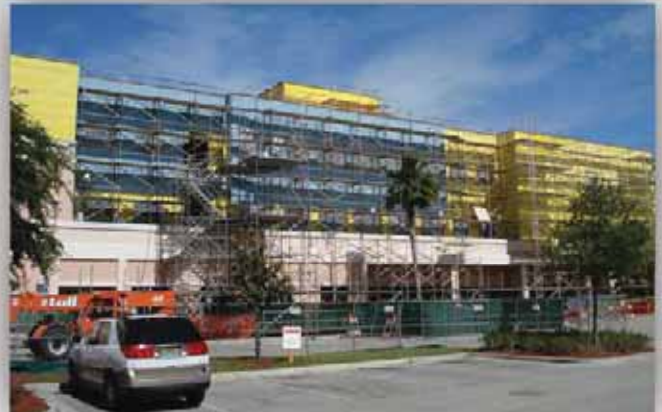
Flagler Hospital Orlando FL

As a skin contractor, Pillar understands and manages all the components of the building envelope. Seamless installation and proper sequencing of components result in a higher quality service.