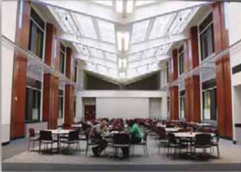
MedImmune Gaithersburg MD 2011

Our extensive experience is the added value that your project demands