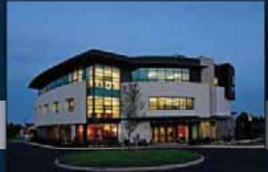
Ba Hai Temple, Centreville VA