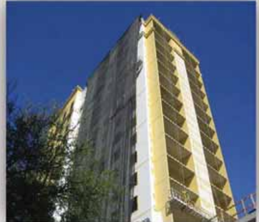
STO GoldGuard barrier Embassy Suites Hotel San Antonio TX

Pillar Construction installs a wide variety of barriers that work in conjunction with any exterior cladding to protect and seal the building.