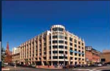
Portrait Building, Washington DC