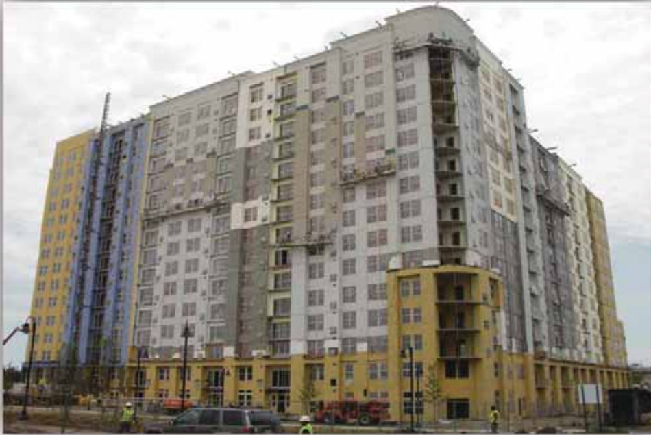
Liquid applied air barrier over exterior sheathing Stamford CT