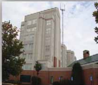
Homewood suites Falls Church VA

Pillar Construction is licensed in over 15 states