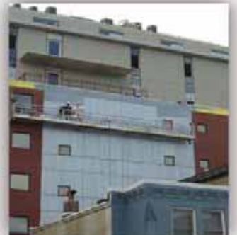
Metallic finish over exterior coatings

Pillar Construction understands and manages all the components of the building envelope for a seamless installation of all the exterior wall components.