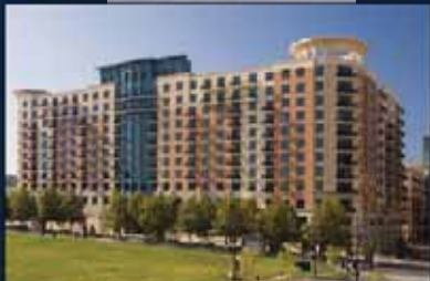
Capital Cove, National Harbor MD