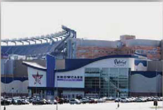
Patriot Place Boston MA 2010

EIFS is a cost efficient, code compliant and environmentally friendly building envelope.