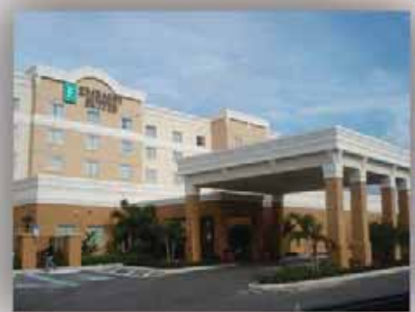
Embassy Suites Tampa FL