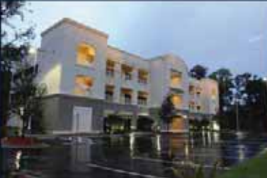
MOB Jacksonville FL