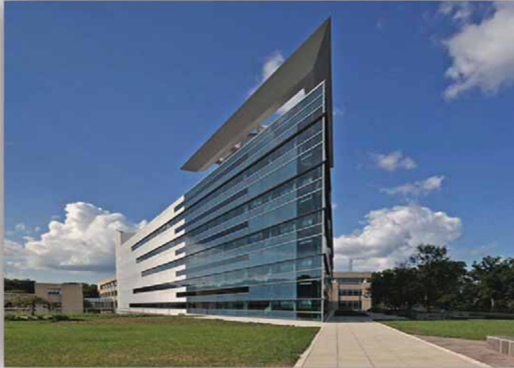
Army National Guard Arlington VA 2011

Pillar construction's competitive pricing, focussed supervision and proactive management make Pillar Construction Drywall a perfect partner on every project.