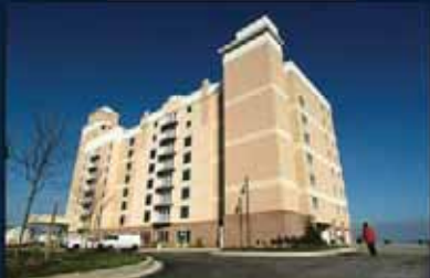
Horizons on the Bay, Chesapeake MD