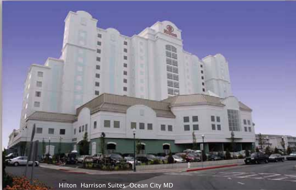
Hilton Harrison Suites Ocean City MD

Pillar construction offers a full and complete array of construction services ranging from metal framing, drywall, insulation, air barriers, exterior coating, sealants and specialty finishes making it a one stop shop for property owners, hospitality and management firms.