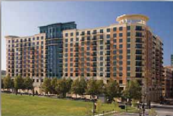
Capital Cove, National Harbor MD. 2009

With millions of square feet of exterior coatings installed, Pillar Construction has the experience to handle high-rise applications as well as complete suburban campuses. Completed projects in the Northeast and Southwest have given us the exposure to almost any kind of site and climate conditions.