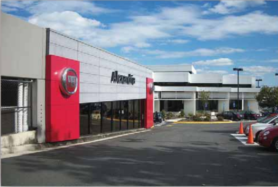
Fiat Alexandria VA