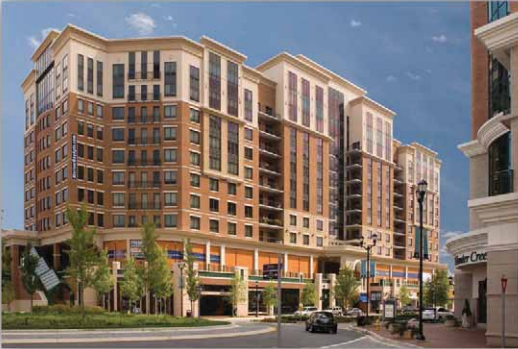
Annapolis Town Center, Annapolis MD. 2009