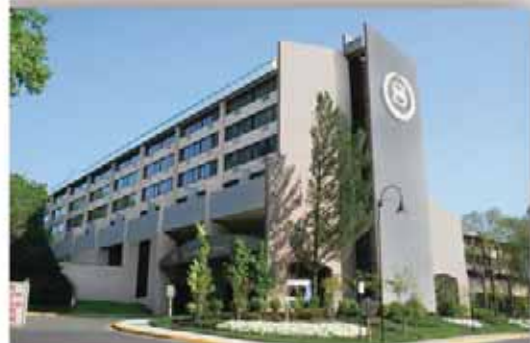
Sheraton Hotel Reston VA