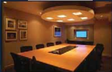
Office space renovation, Alexandria VA