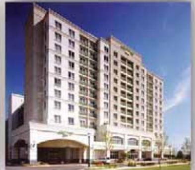
Marriott Tyson's Corner VA