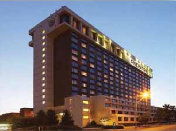
Sheraton Pentagon South Arlington VA