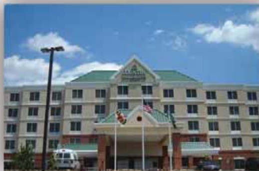
Country Inn and Suites Concord PA