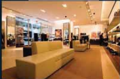
Ferragamo Store Galleria Tyson's Corner, VA