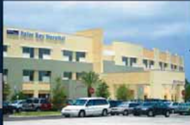
Palm Bay Hospital, Orlando FL