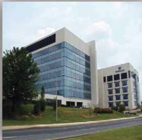
Medimmune Gaithersburg MD