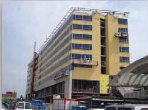
STO GoldGuard application Marriott Hotel New York ave Washington DC.

Membranes and barriers protect the building from air leakage and vapor transmission. Sealing the building envelope is one of the most cost effective ways to increase the energy efficiency of a building.