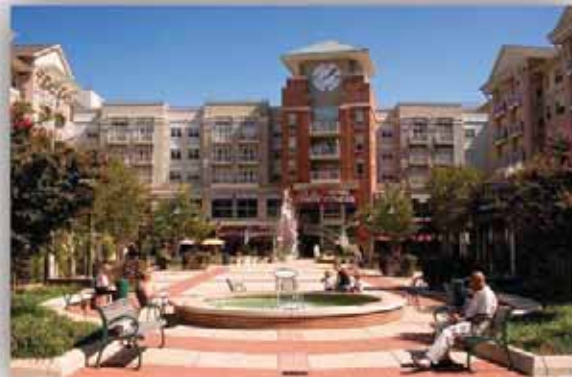
Pentagon Row Arlington VA 2002

EIFS and Stucco claddings have incorporated waterproofing capabilities providing architects countless skin options.