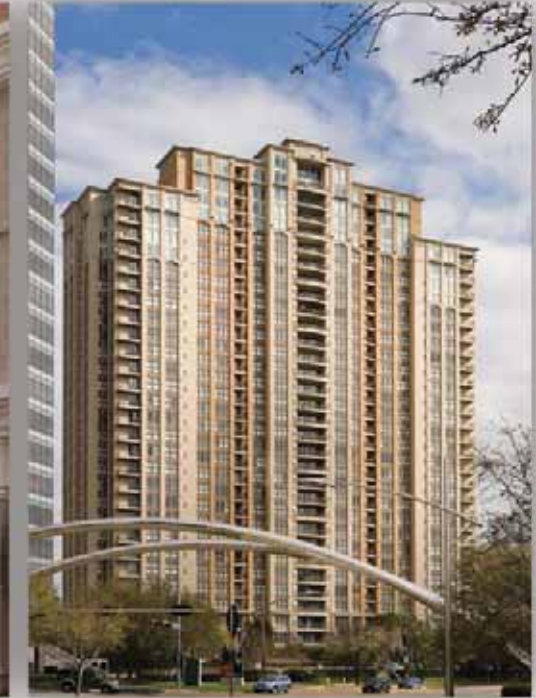
Post Oak Hosuton TX 2003

With millions of square feet of exterior coatings installed, Pillar Construction has the experience to handle high-rise applications as well as complete suburban campuses. Completed projects in the Northeast and Southwest have given us the exposure to almost any kind of site and climate conditions.