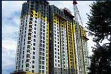
Cherry Creek, Denver CO