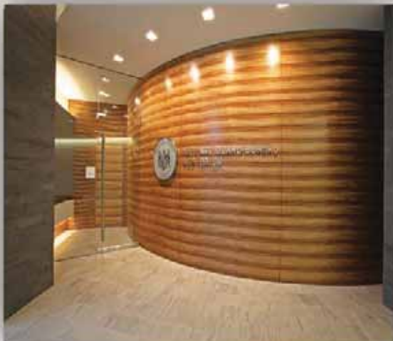
Army National Guard Arlington VA