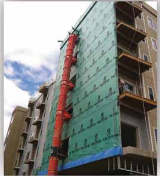
Self adhered membrane behind cement siding Silver Spring MD

Membranes and barriers protect the building from air leakage and vapor transmission. Sealing the building envelope is one of the most cost effective ways to increase the energy efficiency of a building.