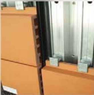
Terra-Cotta RainScreen Facade Systems

New products and facade systems such as terra-cotta and cement board rain screen systems are replacing traditional skin claddings. These systems bring a higher challenge to the building skin contractor. New and innovative exterior claddings, waterproofing products, exterior substructures and framing, all behave as a synergetic assembly.