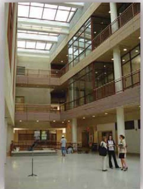
American University Washington DC 2010

We offer a complete drywall package service that includes Internal partition exterior framing acoustical ceilings, thermal and acoustical insulation rough carpentry, spray foam insulation. Our specialty finishes team has successfully completed venetian plaster, textured coating and high end artesian finishes in hospitality, commercial, residential and retail projects.